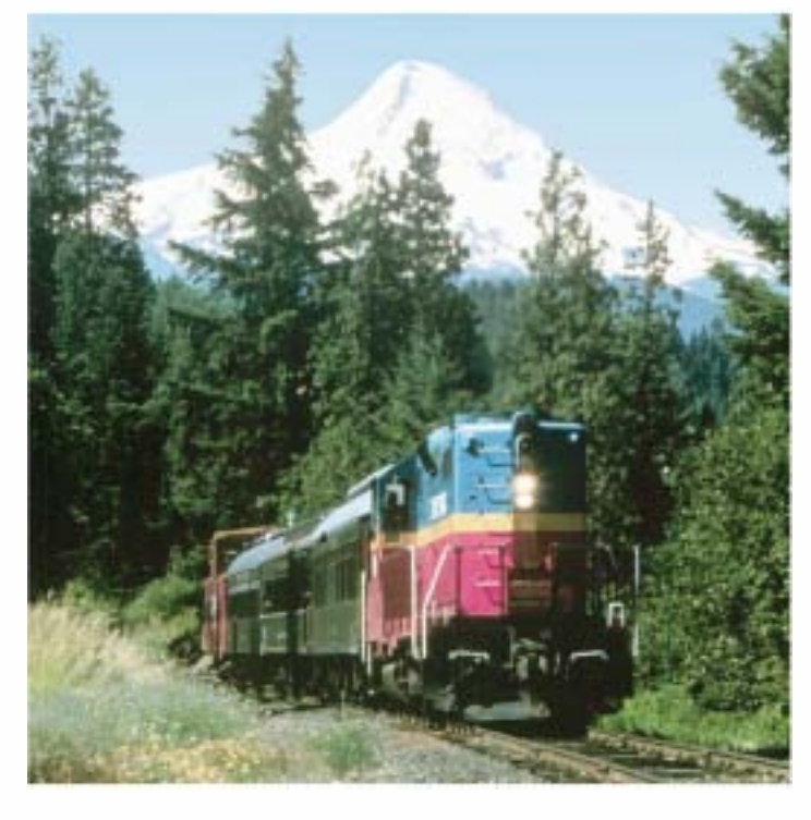
Page 4 Pacific Northwest Chapter National Railway Historical Society The Trainmaster

Mount Hood Railroad – The fun begins the moment you step aboard this century old railroad. Dating from the early 1900s, the Excursion Train is comprised of enclosed coaches, a concession car offering light food and beverage, and the air-conditioned dome car. Sit back, enjoy the great views and visit with friends and family as you travel along the river, through forests, meadows and numerous fruit orchards to the towns of Odell or Parkdale. A live narration along the way covers local history and key points of interest. During the layover, have a picnic in the park, sample local cafes, browse the shops and take in stunning views of Mount Hood. All departures are from downtown Hood River. Excursion, brunch and dinner trains are available. For more information: 800.872.4661 or www.mthoodrr.com