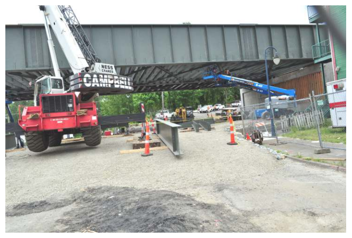
Progress on the new Bridge