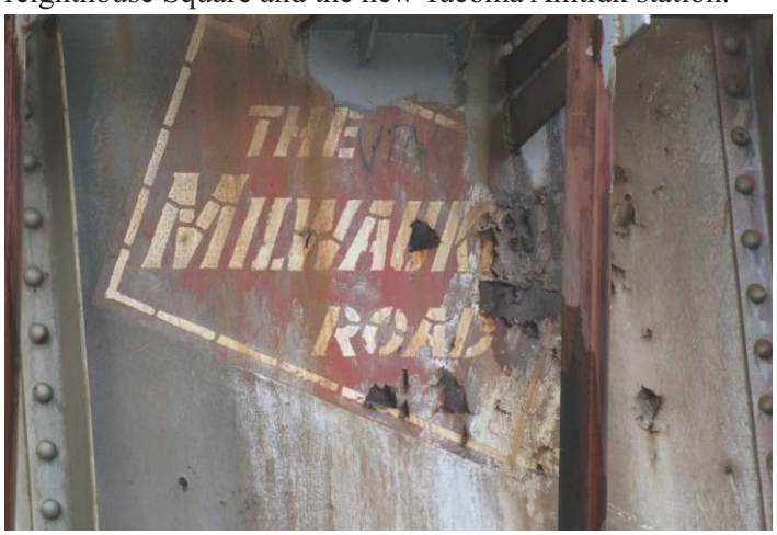
The Milwaukee Road logo on the Bridge