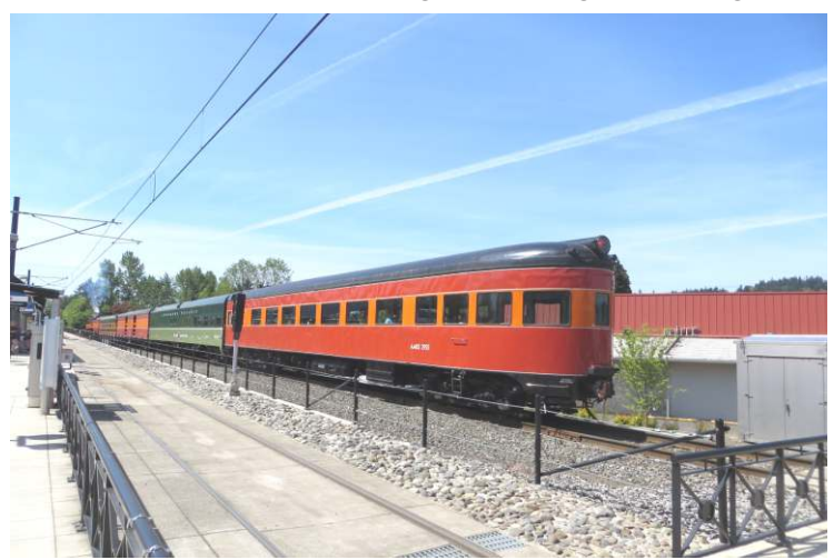
The James J. Gilmore No. 2955 on the Tail of the Special Charter