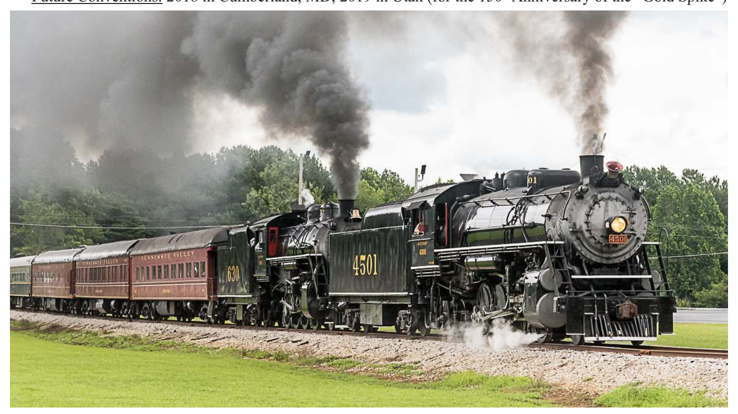
Picture of the Double Header

<u>Future Conferences</u>: October 19 thru 21, 2017 Kansas City; Other Conferences in 2018 are TBD. Future Conventions: 2018 in Cumberland, MD; 2019 in Utah (for the 150<sup>th</sup> Anniversary of the "Gold Spike")