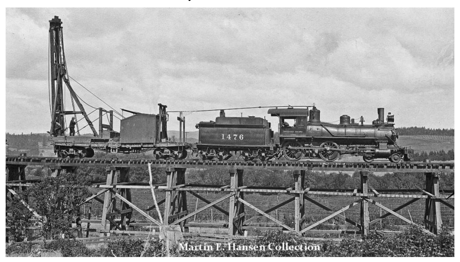
SP 4-4-0 No. 1476 Supplying Steam for the Piledriver

When the boilers of steam locomotives were designed to power the drive wheels for each engine, it was quickly learned that the same steam power could be tapped to power other railroad equipment when needed. In this photograph, we see an early example of this principle employed by the crew of Southern Pacific 4-4-0 No. 1476. The crew of No. 1476 has been assigned to perform some trestle repairs between Cook and Newberg, Oregon. For this duty, they have been given a steam powered piledriver that has been cleverly plumbed off the steam dome of No. 1476. The small size of the steam line that fed steam from the locomotive to the pile driver is testament to the enormous power that even a small amount of steam can produce. H. L. Arey was on hand with his camera to record this fine scene.