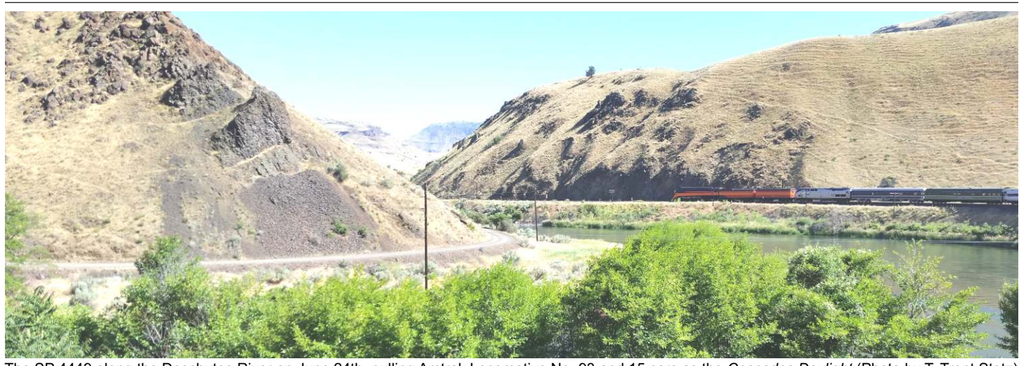
The SP 4449 along the Deschutes River on June 24th, pulling Amtrak Locomotive No. 93 and 15 cars as the Cascades Daylight