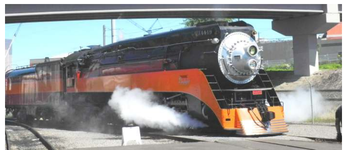
SP 4449 Steamed Up on June 23rd, The day before the trip to Bend

As the Friends of SP4449 volunteers ramp up for the Cascades Daylight 2017 June 24-25 trip to Bend, I am really