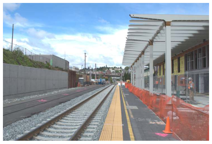
Progress on the new Amtrak Station