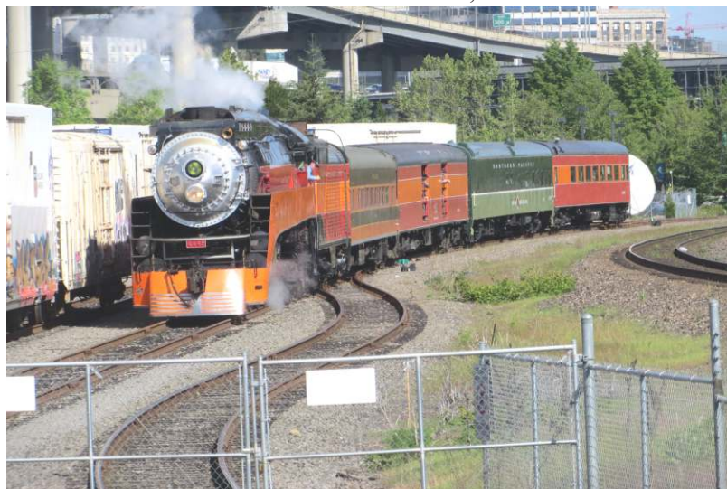
The SP 4449 heading up the Special Charter

The chartered train included the SP 4449, Gordon Zimmerman baggage car, Plum Creek lounge, Traveller's Rest No. 498