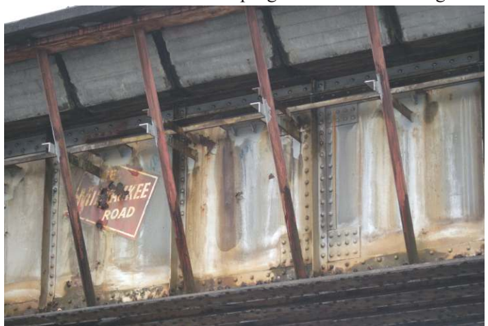
The Milwaukee Road logo on the Bridge

Also shown below is the progress of the new bridge near Freighthouse Square and the new Tacoma Amtrak station.