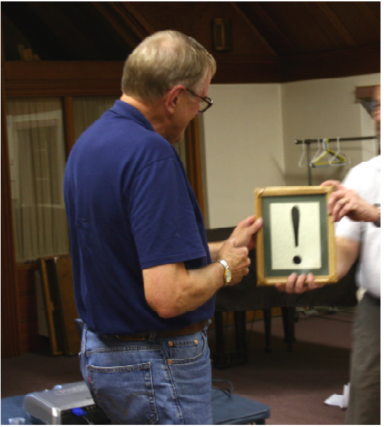
Our noble leader got the point!!!!

On July 11, the Oregon Coast Scenic Railroad (OCSR) along with four Tillamook County Lions Clubs and the Port of Tillamook Bay, sponsored a business excursion for 100 invited guests highlighting the economic opportunities for local businesses if the railroad were restored to service. The Garibaldi