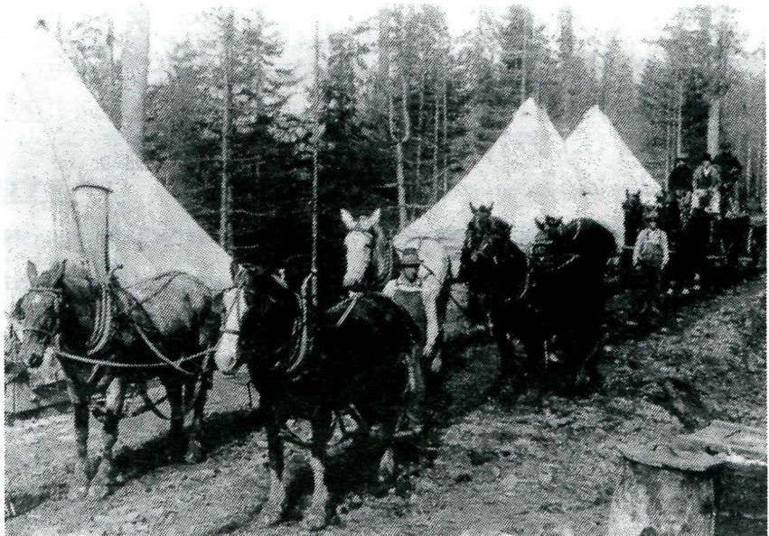
Tents and teams of horses at encampment near Lake Crescent, WA.

The Spruce Production Division was established by the United States War Department in 1917. Initially, the Spruce Division was assigned 10,000 soldiers from the U.S. Army Signal Corps. Even though the patriotic fervor was high, it did not sit well with private timber companies or the unions to have soldiers in the woods competing for precious jobs.