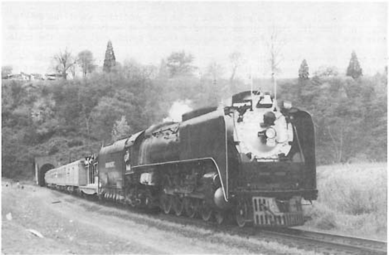
UP 8444 has just emerged from the Peninsula tunnel enroute to the Albina yard. The Expo 74 special has just come over the Kenton freight line along the north edge of Portland.

The purpose of 8444's trip was to publicize the opening of Expo 74 in Spokane, Washington. As the locomotive and its train traveled west from Omaha, Nebraska the flags of the state through which it passed were placed on a special flatcar just behind the 8444. The Oregon flag was added during the overnight stop at Portland. The Washington state flag was the last to be placed aboard during a stop at Cheney, just south of Spokane.