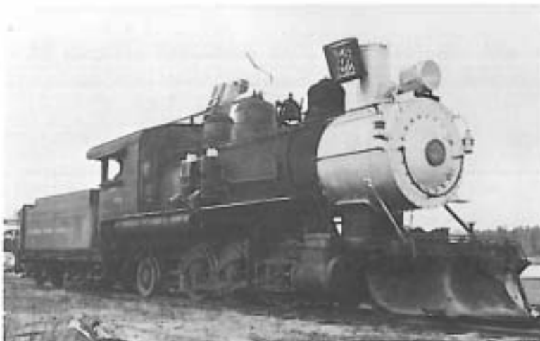
Klamath Northern Railway #204. Originally from Gilchrist-Fordney Company in Laurel, Mississippi. Painted bright red when delivered to Gilchrist Timber Co. Tender still exists as snowplow.