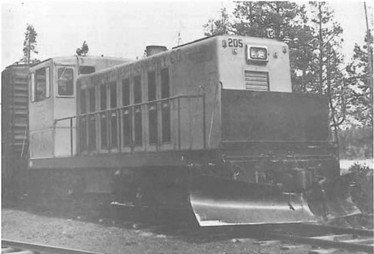
Klamath Northern Railway #205, 70 ton GE purchased in 1955 and still in service.

The use of the name Gilchrist five times in such a short listing would provide some clue