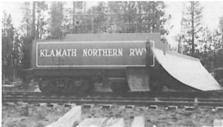
Klamath Northern Railway snowplow. Converted from tender of Baldwin #204. Extra tender built for Gilchrist Timber Company.