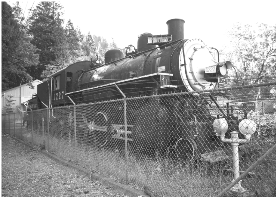
S.P. M-6 No. 1727 was given to Dunsmuir, California by the railroad in 1957. It is looking a bit shabby this day and a grass roots effort has been ongoing by The Friends of the 1727 to cosmetically restore the engine and tender. Photo by Kenneth G. Johnsen, Aug. 19, 2020.

The August 2020 issue of The Trainmaster , with Arlen Sheldrake's note about efforts to cosmetically restore Southern Pacific (SP) 2-6-0 No.1727, landed in my mailbox one day after I had stopped in Dunsmuir, California, to inspect that very engine on my way home from California. The engine is very visible from Interstate 5 and I always make it a point to stop and check out the old gal when I pass through.