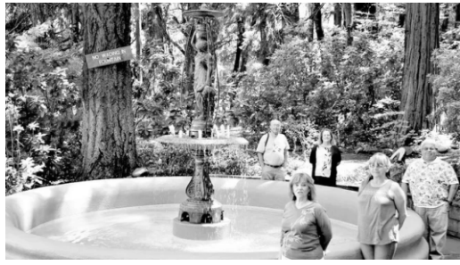
The Restored Fountain from Mount Shasta Herald Photo by Shareen Strauss Jul 8, 2020

The Dunsmuir Fountain was originally located next to the town's depot. It became a community landmark and a symbol of the town's water resources and a centerpiece for the active railroad yard. It was also a gathering place for railroad workers, travelers, tourists, and residents. In 1899, the fountain was damaged under a heavy accumulation of frozen snow and ice. It is thought that the lady who graced the center of the fountain disappeared at this time and a round globe/sprinkler was installed in her place. The fountain was dismantled in the 1960s and the fountain was relocated in the early 1970s at the entrance to the