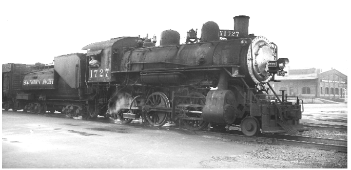
Dunsmuir's future Fresno Mallet #1727 is seen in service at Fresno, California on December 7, 1955. The doughty 2-6-0 has already given its owner 54 years of service at the time of this photo, and is still going strong.

These engines were nicknamed Fresno Mallets because of their amazing amount of strength for their size. In the flatlands of California's San Joaquin Valley they could pull as many cars as Southern Pacific's much bigger Mallet articulateds could pull over the