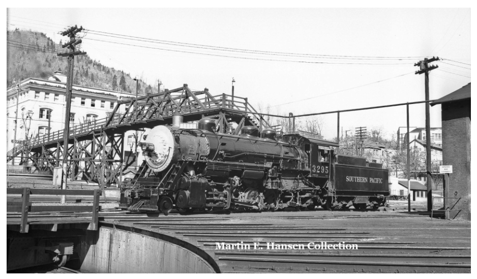
SP No. 3925 at Dunsmuir Railyard Turntable in 1946.