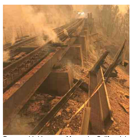
Damaged bridge near Moccasin, Calif. - July 25, 2021. Nearby BNSF Gateway Subdivision (ex-WP "Northern Extension") siding at to resource challenges due Moccasin, Calif, is 6.0 miles north of Keddie, to the additional traffic on Calif., at BNSF MP 196.8 measured south from these alternate routes, this MP 0.0 - Bieber Line Jct, Oregon. Bieber Line Jct. is the main track connection within Klamath re-routing is resulting in Falls, Oregon, between BNSF ex-GN Klamath longer overall transit times Division, and UP ex-SP Oregon Division main by several days compared line

The Dixie Fire is only 23% contained and the forecasted weather conditions are currently unfavorable, which will likely drive increased fire activity into the weekend. BNSF has two fire trains deployed to the area, and they have been active in applying water and other retardants to prevent further damage to structures. Our teams are working closely with CalFire crews in these suppression efforts, with