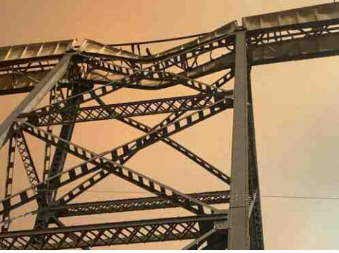
Photos of fire damaged Dry Canyon Bridge Viaduct.