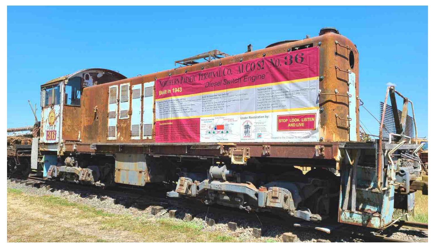
Photo of the Chapter's ALCO S2 Locomotive No. 36 at Powerland Heritage Park in July 2021, with banner for Steam-Up

Diesels were acquired by the Northern Pacific Terminal Company (NPTCo) in the 1940s, including No. 36 in 1943. These 1000 hp ALCO S2 and S4 locomotives could now challenge the steam locomotives. By 1958 the last fire was dropped on a steam locomotive. By 1962, they were gone. With steam gone, the need for a massive support staff also disappeared.