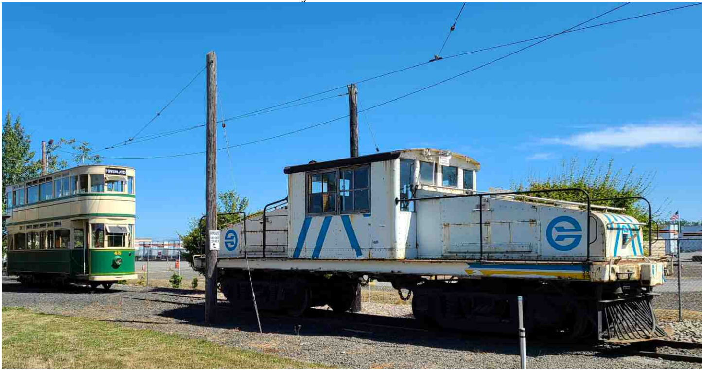
Blackpool Tram No. 48 and Oregon Electric Locomotive No. 21 at Powerland Heritage Park

The COVID-19 delayed 50th Anniversary of Powerland's Steam-Up was held during its traditional two weekends in 2021, on Jul. 24/25th and Jul. 31/Aug. 1st. The Oregon Electric Railway Historical Society (OERHS) had equipment on display around the park, like the Oregon Electric Locomotive No. 21, and were giving rides on Blackpool Tram No. 48.