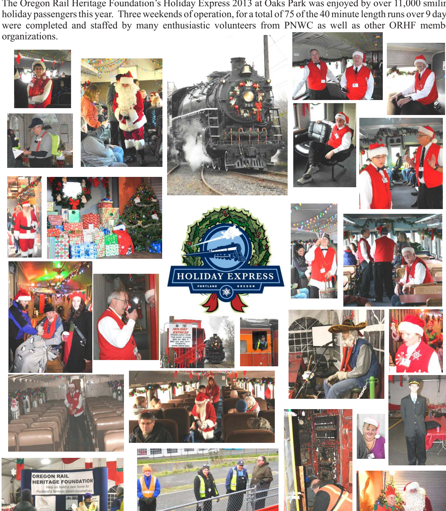
January 2014 Pacific Northwest Chapter National Railway Historical Society The Trainmaster

The Oregon Rail Heritage Foundation's Holiday Express 2013 at Oaks Park was enjoyed by over 11,000 smiling holiday passengers this year. Three weekends of operation, for a total of 75 of the 40 minute length runs over 9 days, were completed and staffed by many enthusiastic volunteers from PNWC as well as other ORHF member