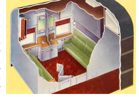
Sleeper-Lounge Double Bedroom as Suite

designed to cut the noise level of the lounge from the sleeping areas.