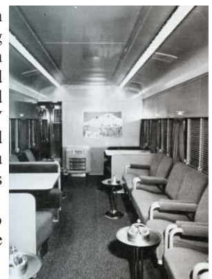
SP&S #600 Mount Hood Lounge Section facing Kitchen

In service the Mt Hood and the Mt St Helens were assigned to trains 1 and 2 known locally as "The Streamliner". Actually train number 1 began its run from the Spokane Great Northern station at 12:06 in the morning as the Portland section of the Empire Builder. Passengers could occupy their rooms in Spokane at 9:00 PM and could imbibe a few cocktails and retire before the train left Spokane. In the town of Pasco, Washington, the Portland section of the Northern Pacific's North Coast Limited was attached and the combined train proceeded down the gorge for a 7:15 AM arrival in Portland.