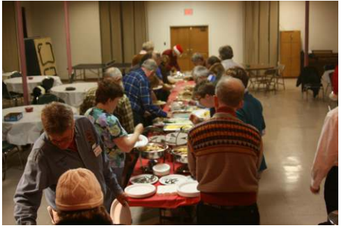
Chapter members enjoying the potluck meal