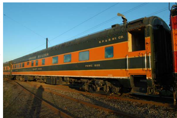
The Mt Hood as part of the Holiday Express consist in 2011 (Note: the shadow of your editor taking the picture!)