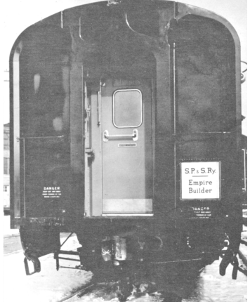
SP&S #600 Mount Hood - Rear end of car featured an illuminated Empire Builder sign

The Mt Hood was ordered specifically to be the tail car for the Portland-Spokane section of the Great Northern's Empire Builder. The official car number of the Mt Hood is number 600. However, it never wore its number and was always lettered the Mt Hood. It was originally painted in the Empire Builder colors that you see today, but the car is labeled S P & S Ry. Co. next to the vestibule and next to the tail light. If you stand outside, you can see the red marker lights, one on each side, near the roof of the lounge end that were used to indicate the end of the train. The car also had an illuminated sign to the right of the end door which read S P & S Ry., Empire Builder. On the roof of the Mt Hood, there is a full length antenna which runs the length of the car. This feature allowed for commercial radio reception in the lounge section of the car.