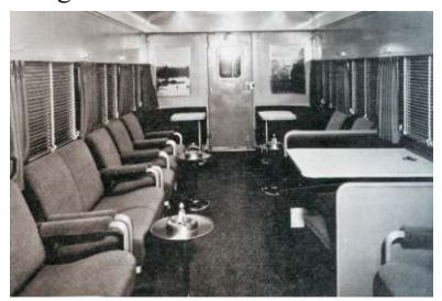
SP&S #600 Mount Hood Sleeper Lounge car - Lounge section facing blind end of car

The lounge area contains a kitchen plus lounge seating for a little over twenty passengers. The only major difference in the layout of the 1950 lounge and today is that the four free standing ashtrays are missing. Next to the kitchen wall is a Farnsworth radio with preset station buttons to pick up each available station between Portland and Spokane. Although this seems quaint today, radio reception and entertainment was a desired amenity on important trains in the pre-TV age. The lounge attendant, who was also the porter, would have served drinks and light snacks during the day and evening. In the morning, you could not expect much more than toast and coffee. A full diner was available for more hearty fare.