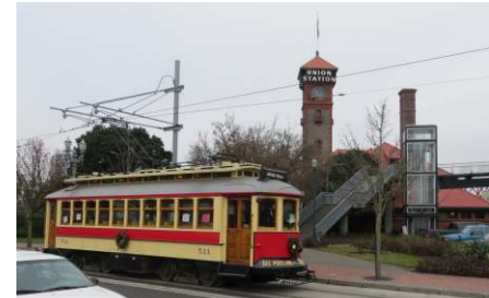
Vintage Trolley No. 511 passes by Union Station in Dec. 2013