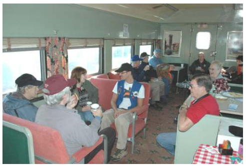
A Chapter event on the Mt Hood in 2009

The Mt Hood continued to do trips until 2006 when rising insurance premiums put an end to mainline trips without Amtrak coverage. This also ushered in the need for Amtrak certification, which the Mt Hood