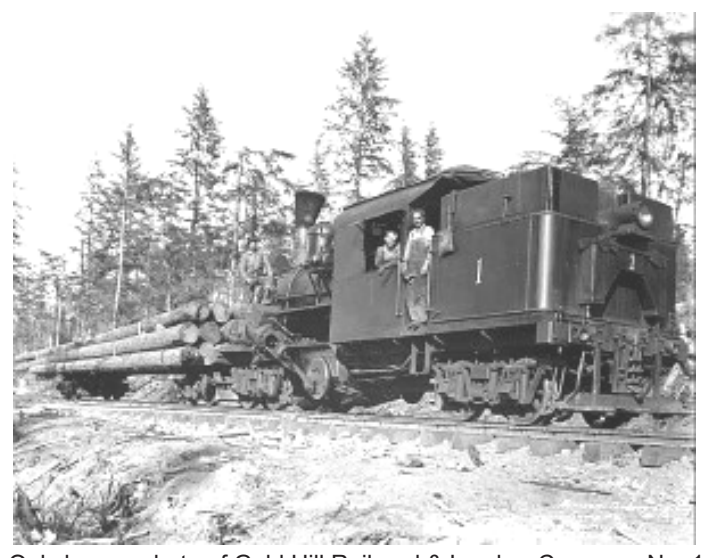
Only known photo of Gold Hill Railroad & Lumber Company No. 1

This is the short story about the Gold Hill Railroad & Lumber Company (GHR&LR Co). It is one of those little logging railroad operations that seemingly no one has ever heard about. In fact, it is because of this railroad that I began my research to document the 60-plus companies that once interchanged traffic with the 300-mile long Siskiyou line of the Southern Pacific.