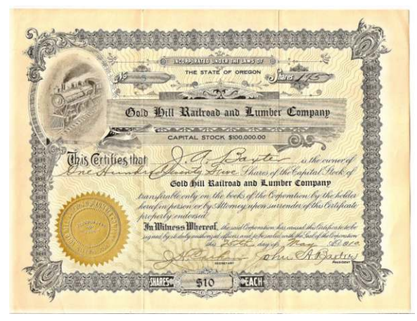
A certificate for 175 shares of stock issued to John A. Baxter to himself on May 25,1910

While the standard gauge operation out of Chavner Junction used a new Climax, the two-foot gauge operation never owned a locomotive. Fragmentary evidence indicates that loaded log cars used gravity to move downgrade to the small mill, which was likely location near the junction of the left and right forks of Sardine Creek. The empty cars