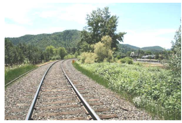
This is looking north on the SP at Chavner Junction in May 2011. SP's bridge over the Rogue River and the town of Gold Hill are in the middle right distance. The Rogue River is also on the right.

In the ninety two years since the railroads disappeared, several hiking trips have found little evidence. Chavner Junction was easy to find, but from ground level it's hard to see positive evidence where the railroad ran. Using Google Maps the right of way is easier to spot as it leaves westerly from the SP and towards the hills around Kanes Creek. Today, an irrigation canal sits in where part of the railroad once lay.