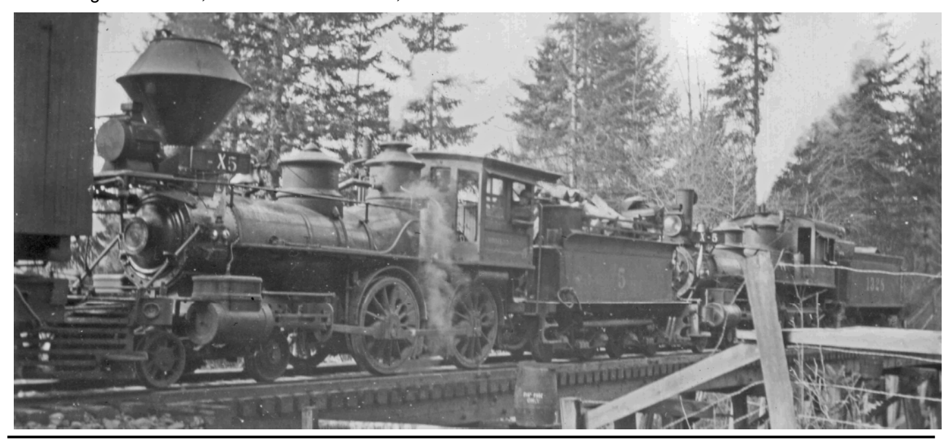
Page 10 May 2010 Pacific Northwest Chapter National Railway Historical Society The Trainmaster

Below: This pair of ancient 4-4-0s appear to be in work train service. The car coupled to the pilot of the #5 seems to be either a derrick or pile driver. The #5 also sports extra plumbing from the steam dome to supply steam to an external use. The trailing locomotive, #1325, was rebuilt from #1291 in 1907. She was built by Rogers in 1872. #5's heritage is more questionable. Espee had several #5s acquired from subsidiary roads over the years, and, unfortunately, several meet the general description of the locomotive in this photo. Can anyone supply the history of this engine?