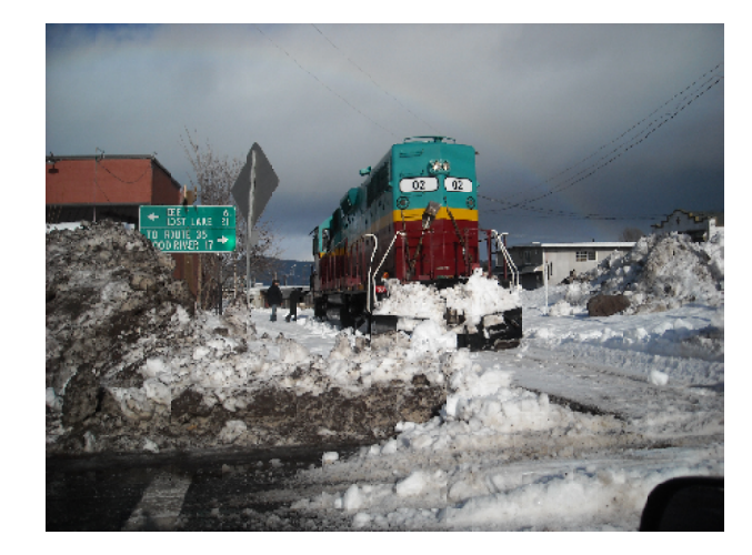
Above: The train made it to Parkdale, MP 21, but snow buildup prevented it from reaching the top of the line (Elev. 1740). There was too much snow to plow up the 3.6% grade with this train and the icing conditions. With all handbrakes applied, the train still slid downhill.

Left: A rare winter MHRR run to Parkdale with a light engine on January 6, 2009.