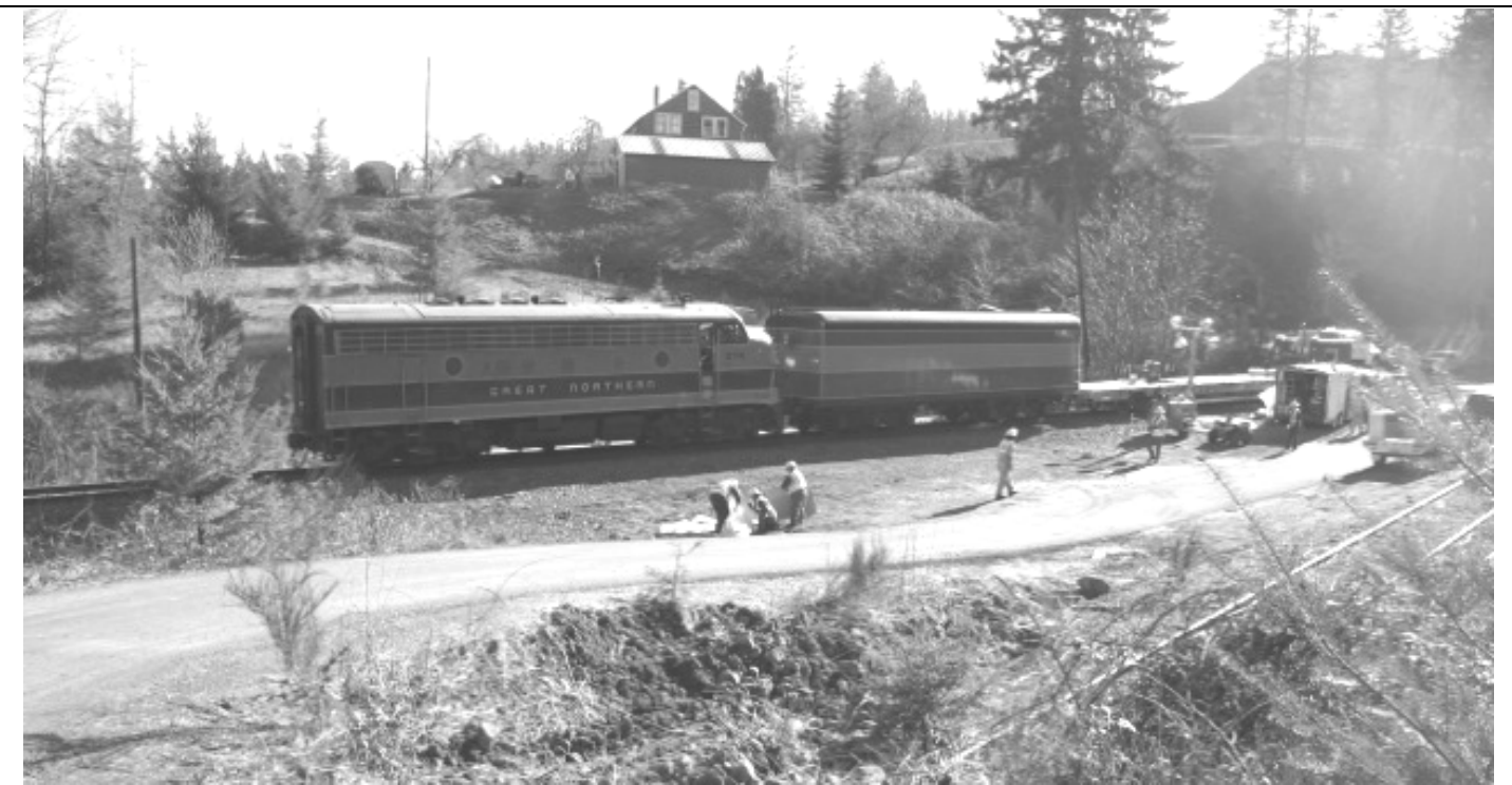
Photo at the west portal before loading the fire truck; David Anzur photo.

have to be scrapped. As a solution to this new problem, the train with fire truck would remain outside the west portal and some 3000' of fire hose was laid into the tunnel for P&W crews to fight the fire. Special nozzles were built by Doyle on February 3<sup>rd</sup> that were used both on a track hoe and hand held.