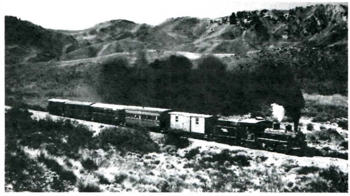
We return to Aregentina's Esquel line