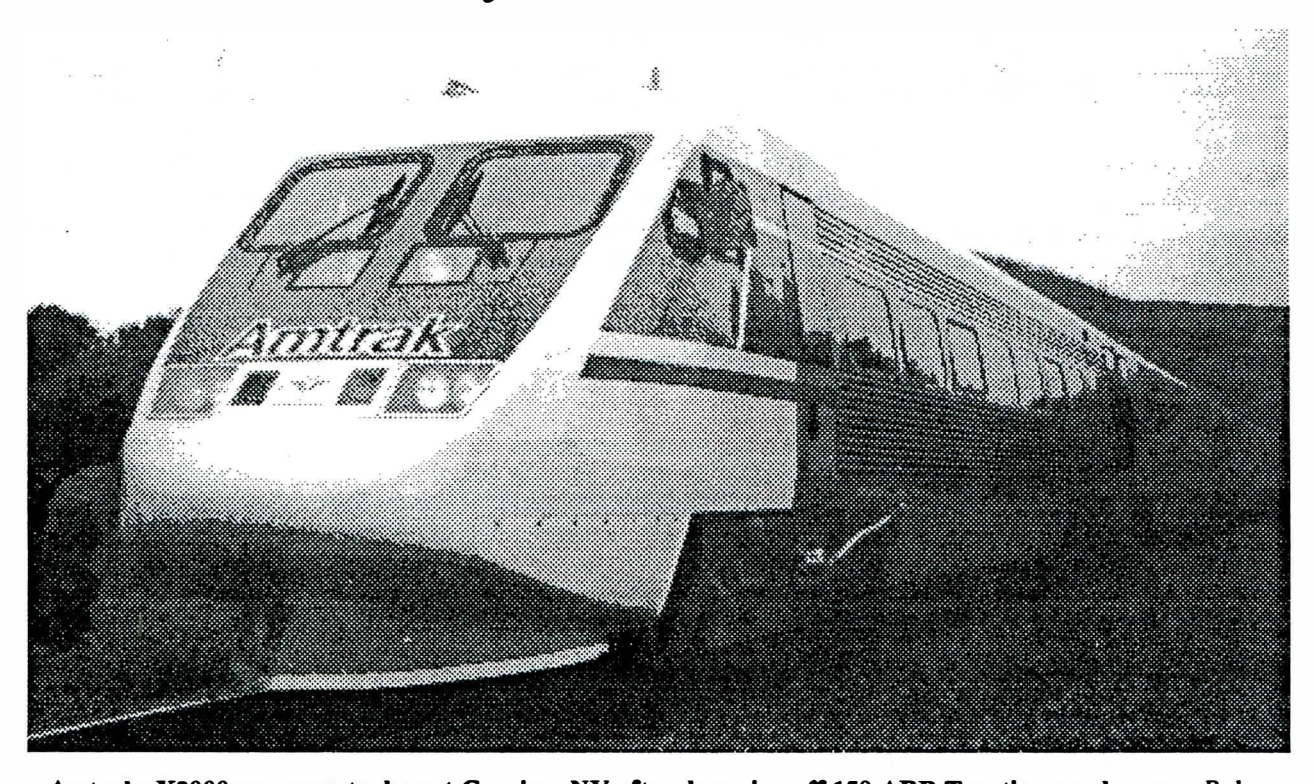
Amtraks X2000 prepares to depart Corning, NY after dropping off 150 ABB Traction employees. -Rob

On May 10 and 11, 1993, the residents of the Elmira, New York area welcomed with much fanfare, what has become a familiar face in rail transportation—the X2000.