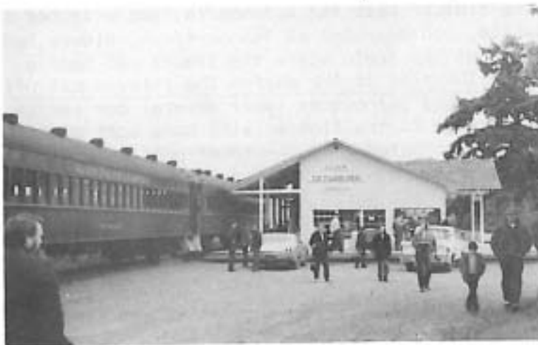
Photo at left taken on May 5th during inspection tour of yards by Railcon delegates.

Depot of the Oregon, Pacific and Eastern Railroad at the Village Green in Cottage Grove, Oregon. Coaches shown at left were used in filming "Emperor of the North Pole".