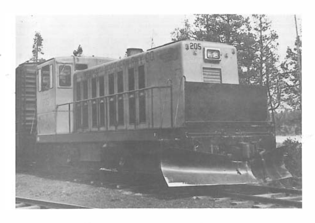
Klamath Northern Railway #205, 70 ton GE purchased in 1955 and still in service.

The use of the name Gilchrist five times in such a short listing would provide some clue